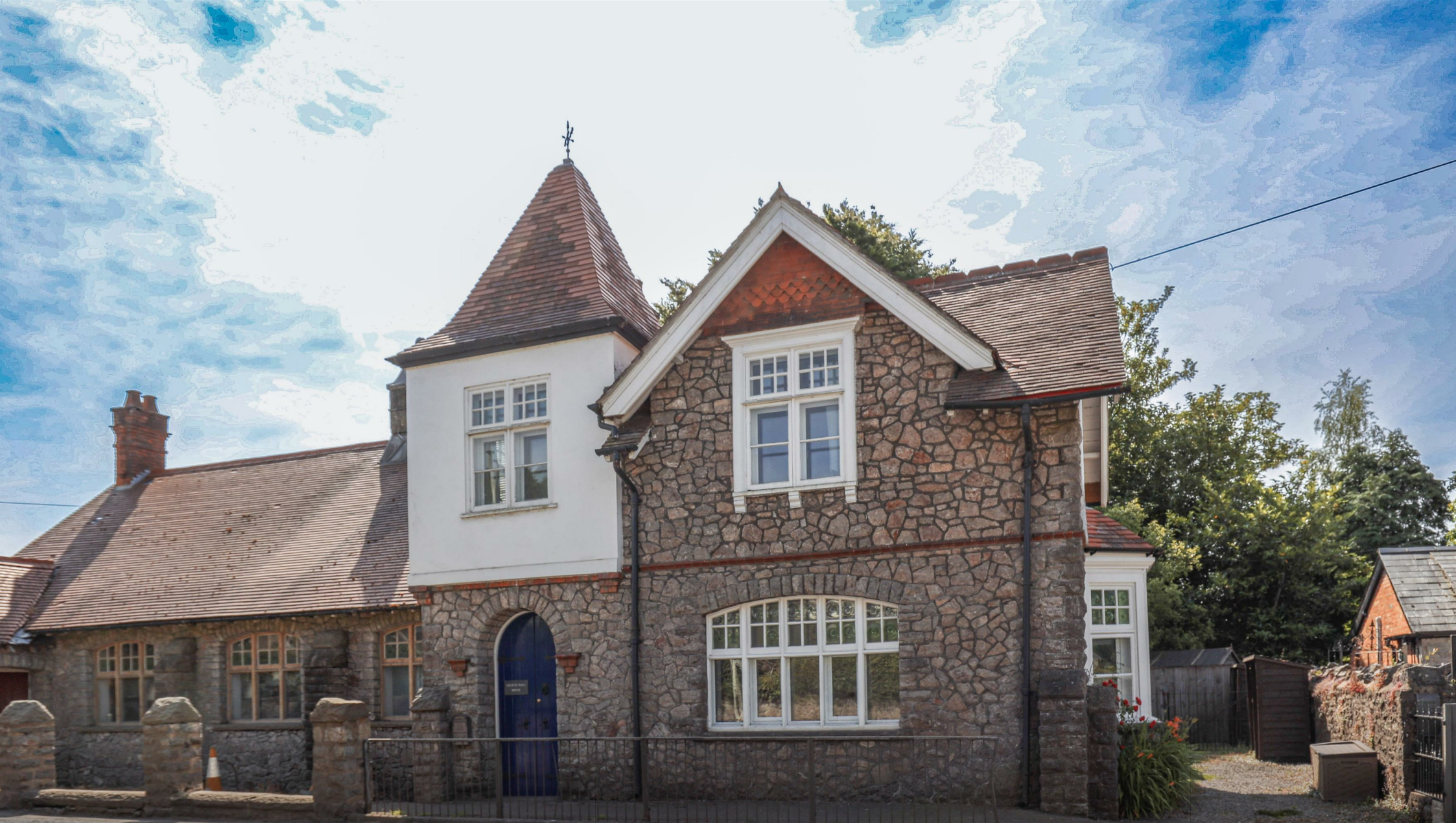
Church Hall House, Cowbridge Road Vale of Glamorgan, CF5 6SH